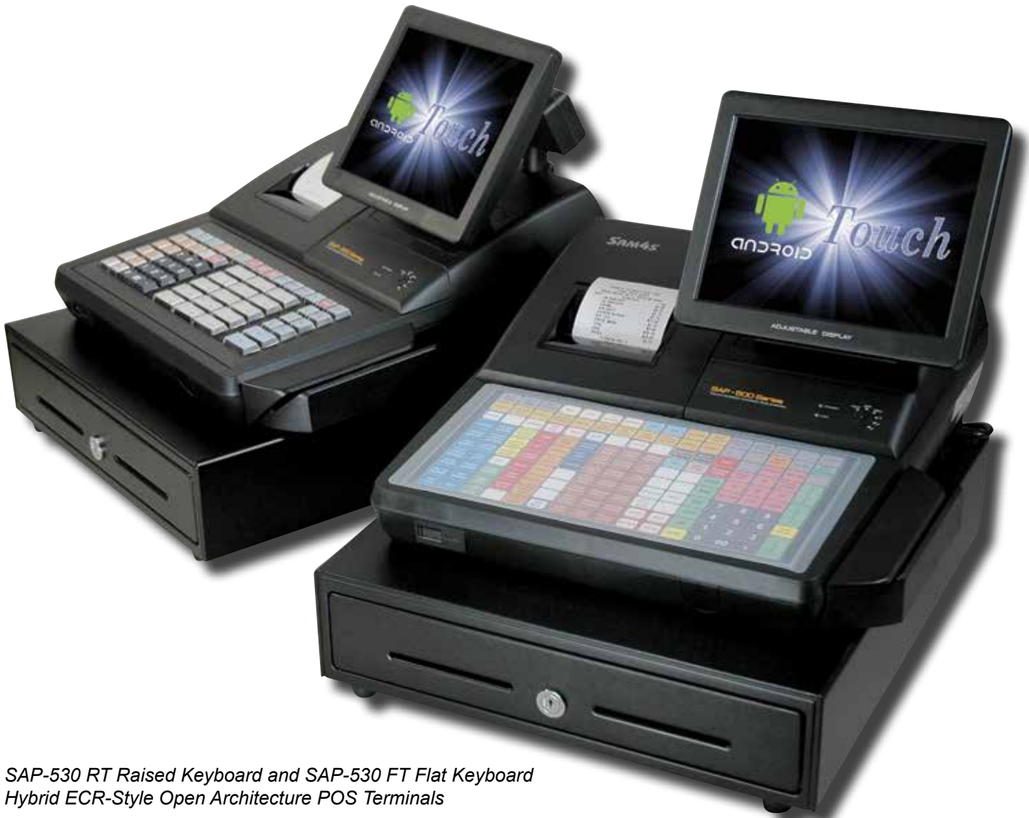
SAP-530 RT Raised Keyboard and SAP-530 FT Flat Keyboard Hybrid ECR-Style Open Architecture POS Terminals

Hybrid ECR-Style Open Architecture POS Terminals